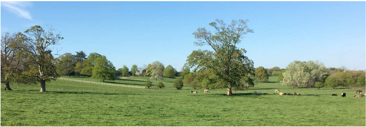
Cattle now graze in 'The Park', H6

There is a bank visible below Holt Manor's south-west drive which follows the park boundary, but otherwise there are no obvious banks or ditches to mark the boundary.