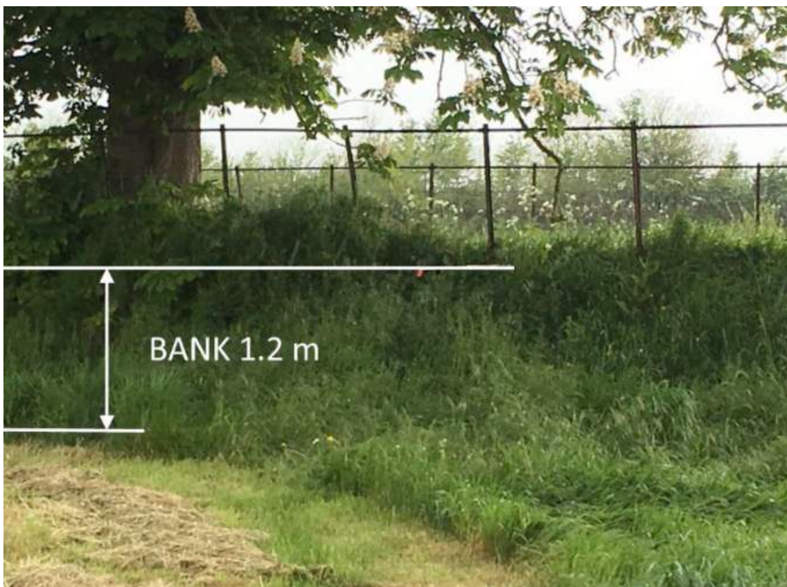
Possible park boundary bank visible below Holt Manor's south-west drive

There is a bank visible below Holt Manor's south-west drive which follows the park boundary, but otherwise there are no obvious banks or ditches to mark the boundary.